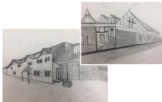
↑ This week, the children have also enjoyed creating some extremely impressive sketches of Lledr Hall.