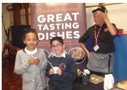
↑ Pupils enjoyed tasting the Quorn food samples at Monday's tasting event.

→ This week 5B are looking at RE, in particular Judaism. Here they are practising plays about Abraham.