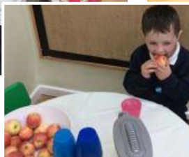
Hello from all the Starfish!