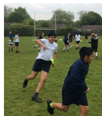
Last week, pupils enjoyed the great outdoors in the sunshine; here they are playing dodgeball