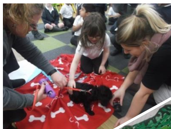
↑ We loved stroking Beau, the puppy. Look at our fabulous frog! →