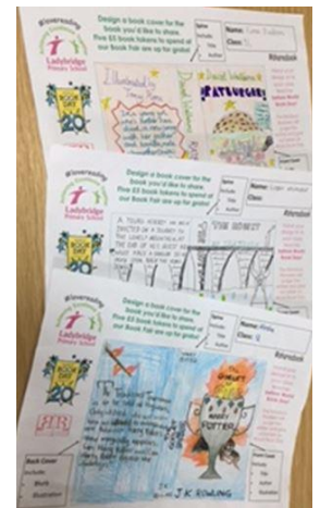
↑ World Book Day competition entries