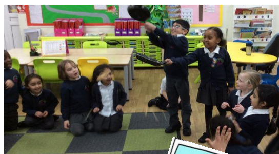
↑ Year 1 had fun flipping pancakes on Shrove Tuesday

Please ensure your account is not in arrears. If you wish to change to packed lunches, 3 weeks' notice is required. Thank you.