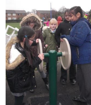
Working out on the new fitness equipment